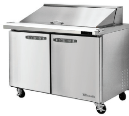
BLMT36-HC / BLMT48-HC