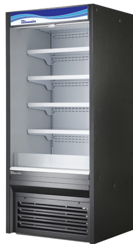
BOD-36S / BOD-48S