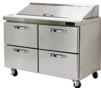
BLPT48-D4-HC / BLPT60-D4-HC