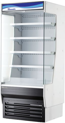
BOD-36G / BOD-48G