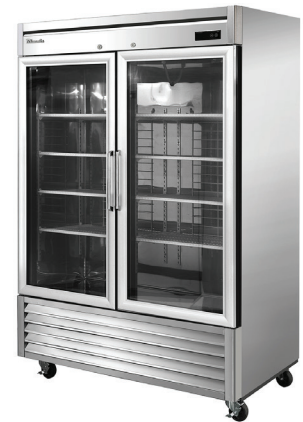
BSR49G-HC / BSR49GP-HC