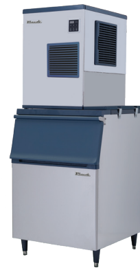
BLMI-500A & BLIB-500S