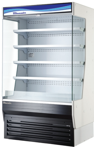
BOD-60G / BOD-72G