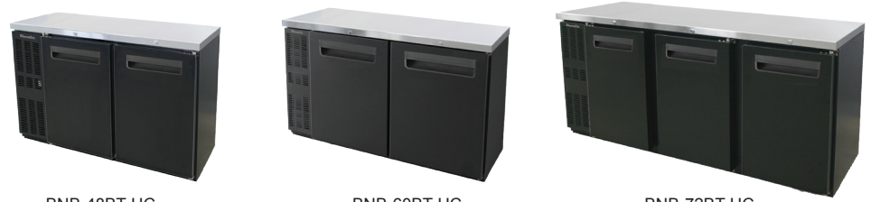
BNB-48BT-HC BNB-60BT-HC BNB-72BT-HC