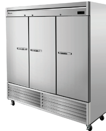
BSR72-HC / BSF72-HC