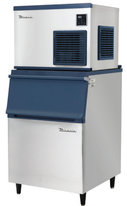
BLMI-500AD & BLIB-500S