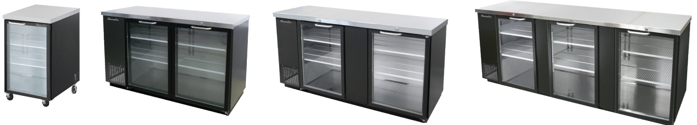
BBB23-1BG(SG)-HC BBB59-2BG(SG)-HC BBB69-3BG(SG)-HC BBB90-4BG(SG)-HC