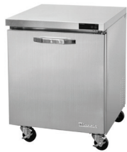
BLUR28-HC / BLUF28-HC