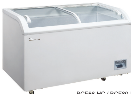
BCF56-HC / BCF80-HC