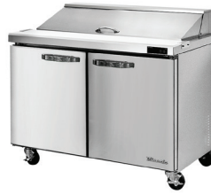
BLPT48-HC / BLPT60-HC