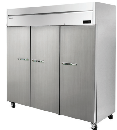
BSR72T-HC / BSF72T-HC