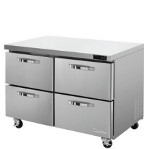
BLUR48-D4-HC / BLUR60-D4-HC