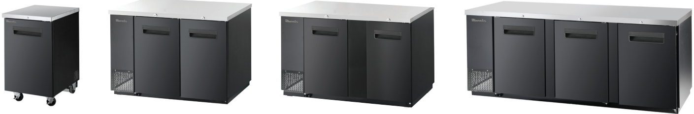
BBB23-1B(S)-HC BBB59-2B(S)-HC BBB69-3B(S)-HC BBB90-4B(S)-HC