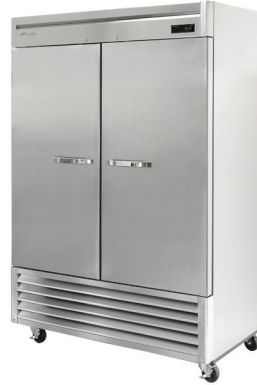
BSR49-HC / BSF49-HC