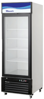
BKGM12-HC BKGM14-HC BKGM23-HC