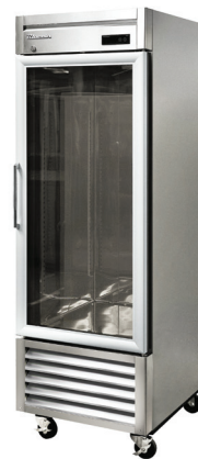
BSR23G-HC / BSR23GP-HC