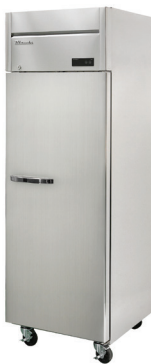
BSR23T-HC / BSF23T-HC