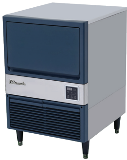
BLUI-100A / BLUI-150A