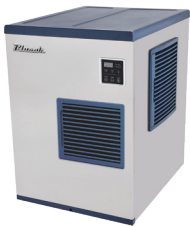
BLMI-300A / BLMI-500A