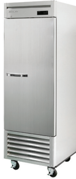
BSR23-HC / BSF23-HC