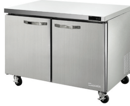
BLUR36-HC / BLUF36-HC BLUR48-HC / BLUF48-HC BLUR60-HC / BLUF60-HC