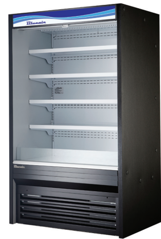
BOD-60S / BOD-72S