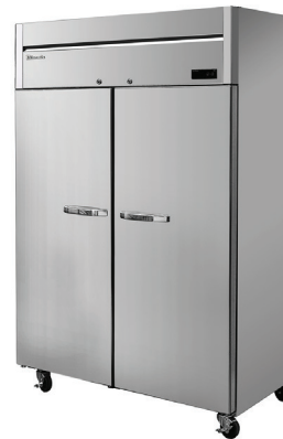
BSR49T-HC / BSF49T-HC