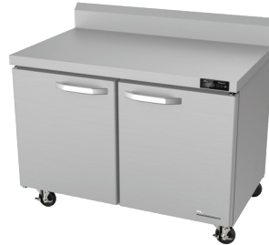
BLUR48-WT-HC / BLUR60-WT-HC BLUF48-WT-HC / BLUF60-WT-HC